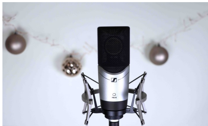
MK 4 pictured with optional MKS 4 shock-mount

With the typical warm sound of a studio condenser mic, the MK 4 is a great all-rounder for podcasting and voice-overs, as well as for recording vocals and instruments. It delivers fantastic sound quality, while still being an affordable choice for home recording.